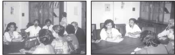
Birth of SACA

The 7 th SACA congress which was held at Kathamandu Nepal in Feb 2007 was unique in many respects. It was not only attended in large numbers but also by the representatives from all member SAARC nations. The main highlight of the congress was the presentations on–Anaesthesia challenges-